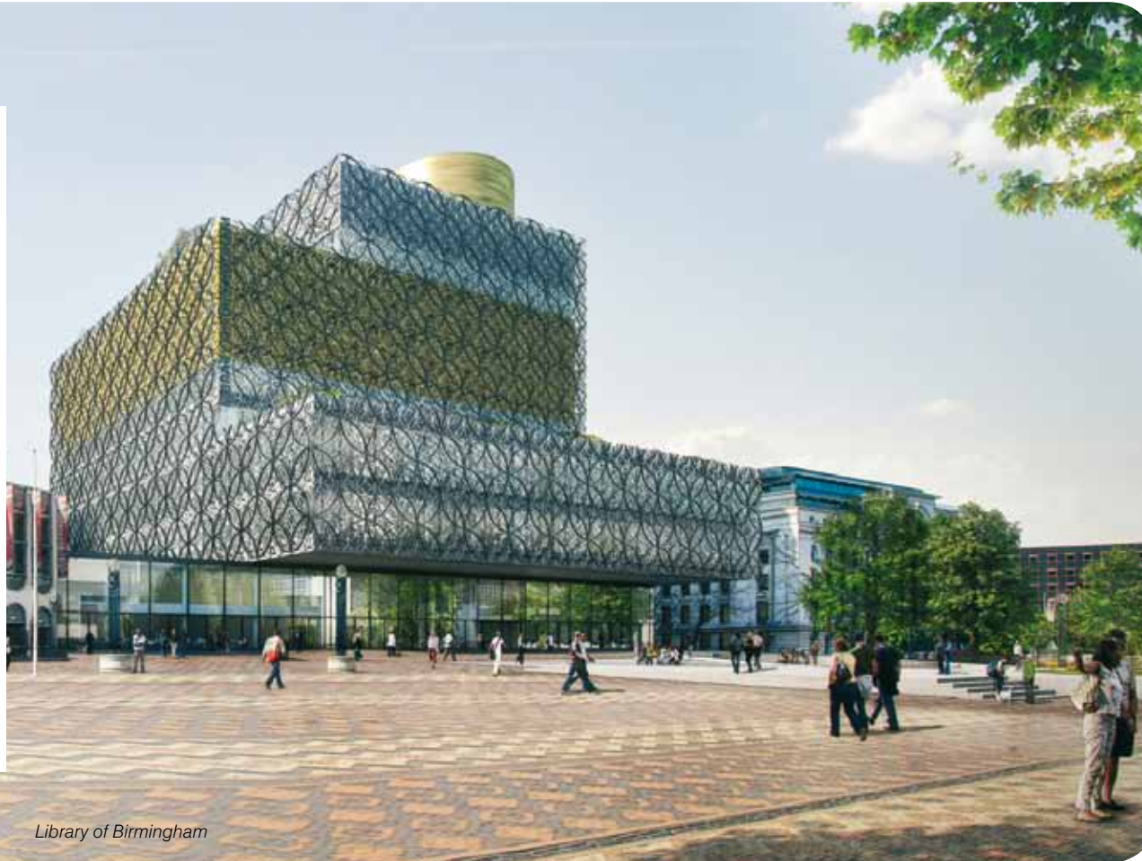
Library of Birmingham

Our work to lobby for the improvement of the currently vacant buildings and ground floor units continues. Last autumn saw the BID invest £10,000 to brighten and cover the units that are currently boarded up. This project received great feedback and plans for further enhancements of this nature are underway.