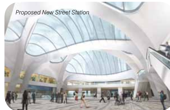
Proposed New Street Station