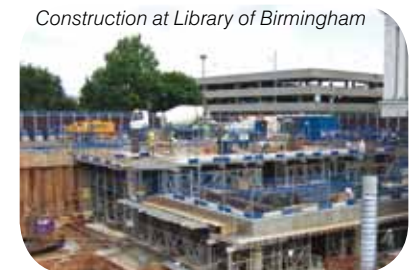
Construction at Library of Birmingham